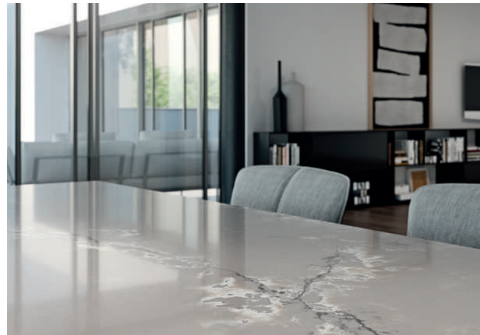
ICE OF GENESIS, Ice White