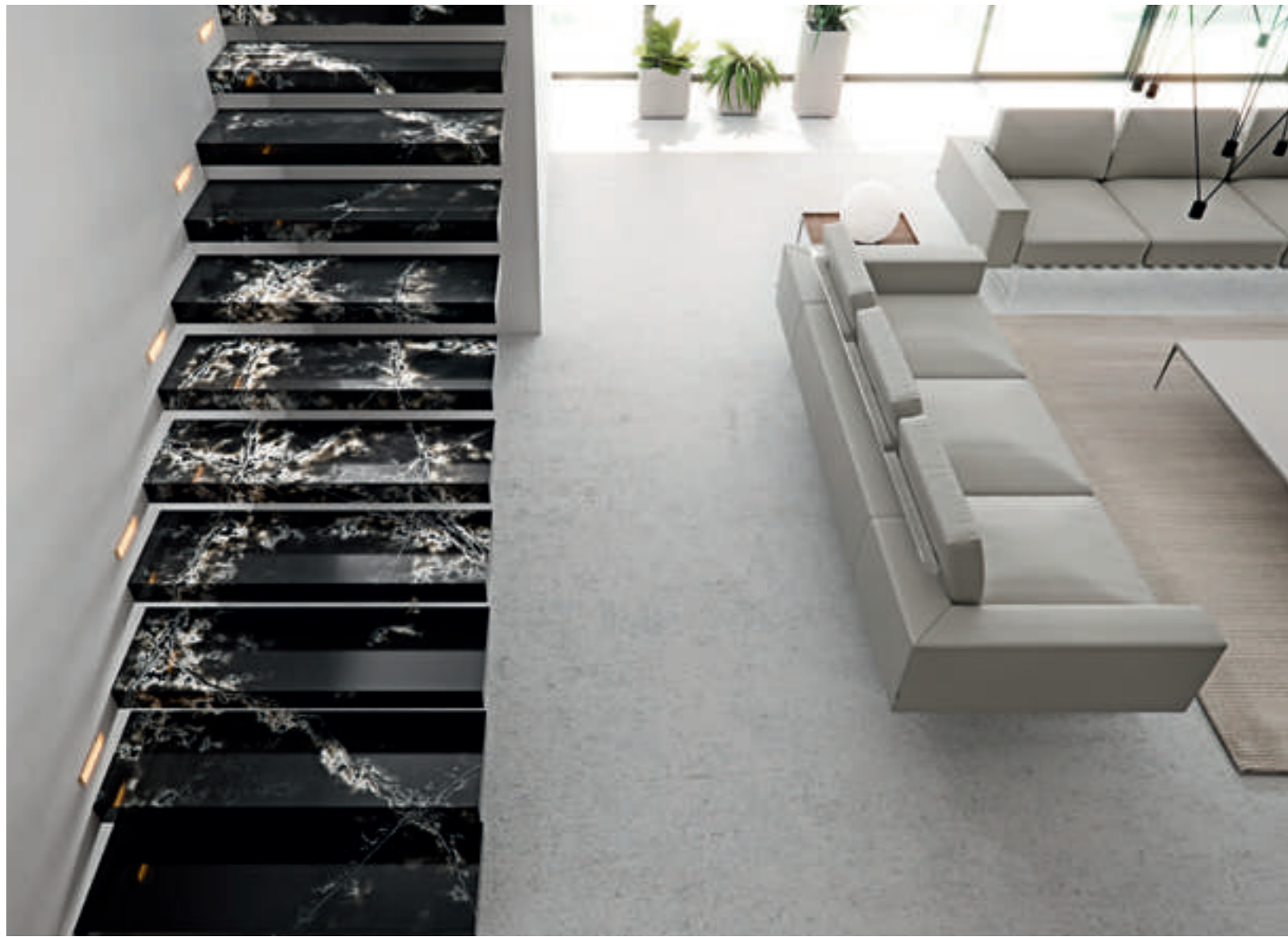
ICE OF GENESIS, Ice Black