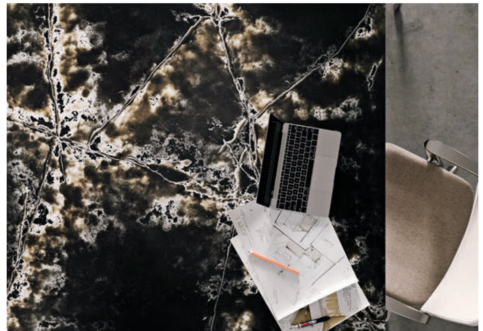
ICE OF GENESIS, Ice Black