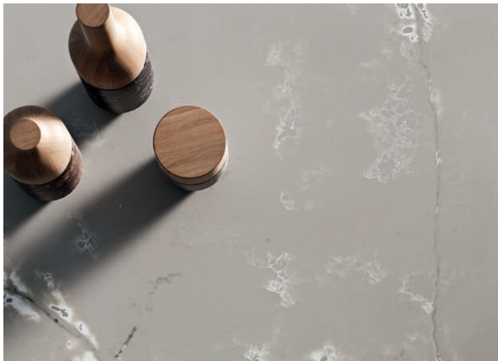
ICE OF GENESIS, Ice White