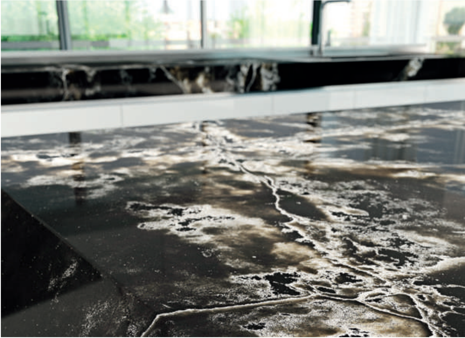
ICE OF GENESIS, Ice Black