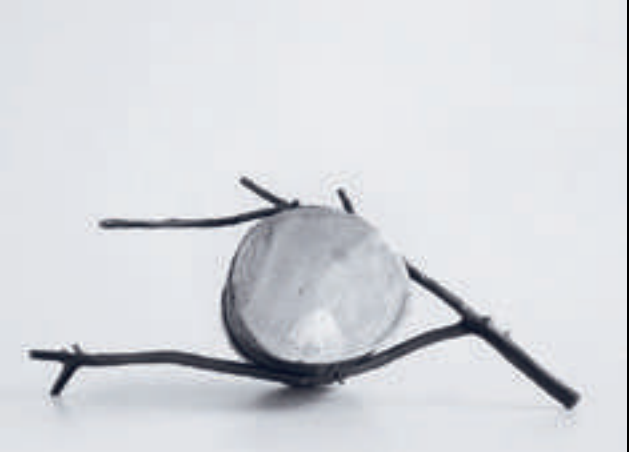
1. FacetFormation 62 Bronze Edition 1/8, 2016 2. LogBronze 29A Bronze Edition 8, 2016