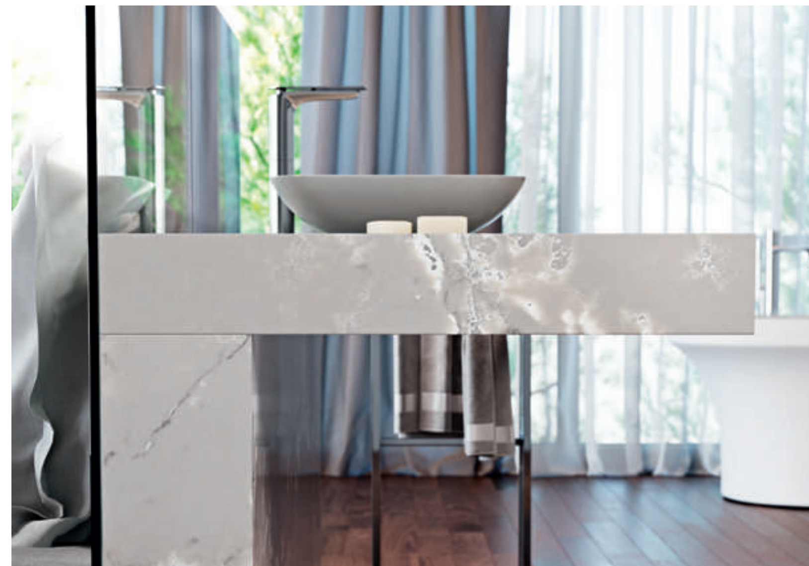
ICE OF GENESIS, Ice White