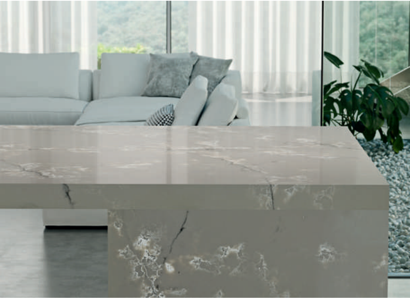
ICE OF GENESIS, Ice White