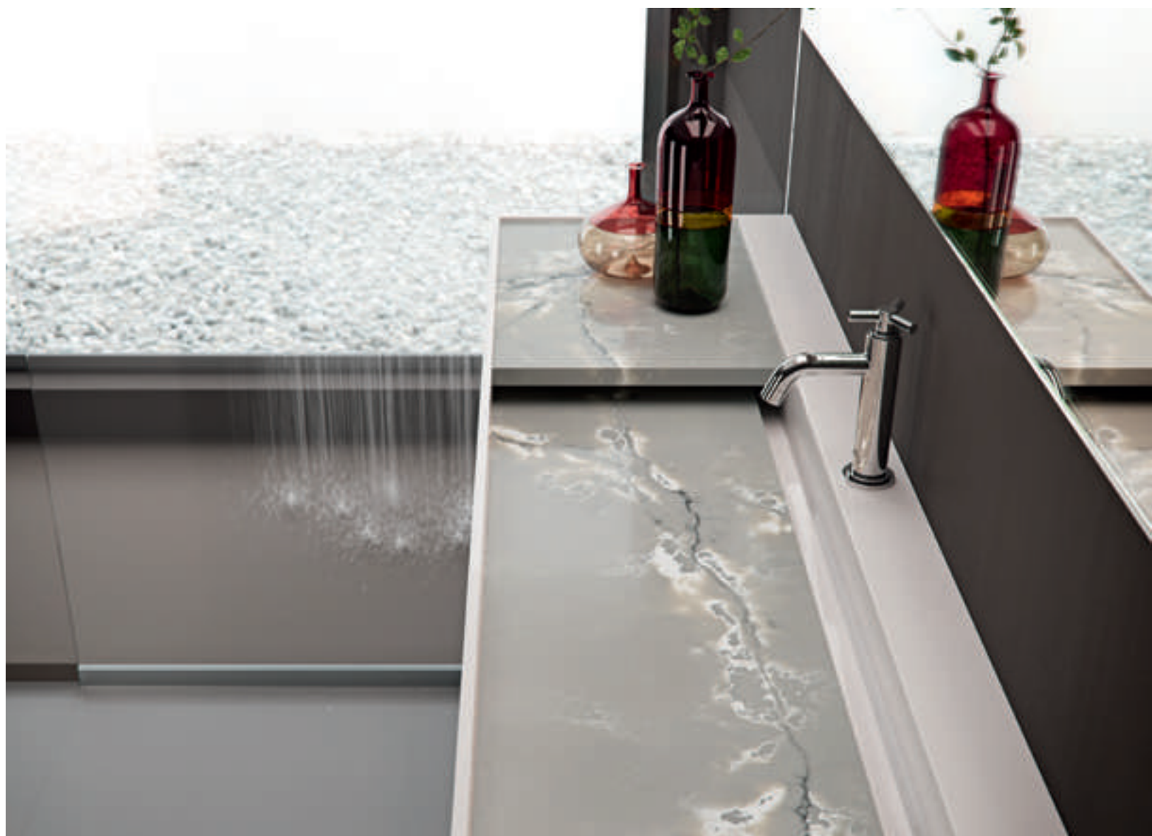
ICE OF GENESIS, Ice White